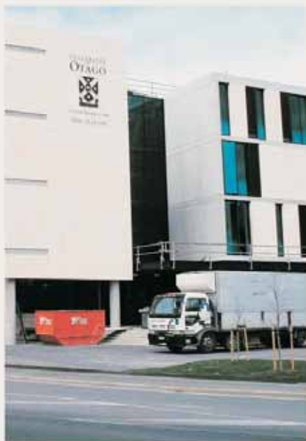
Otago University's Plaza One complex holds classrooms, sports facilities, and other amenities.

Lunds Joinery's decades of experience paid off in the biggest job it carried out this year - fitting out Otago University's Plaza One building.