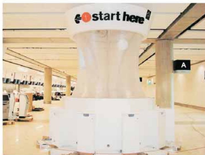
The self check-in counters Lunds Joinery built for Air NZ have a Hi-Macs base and middle section of Kaynemaile.

The joinery shop was also busy with two major hotel refurbishments this year, one on the West Coast