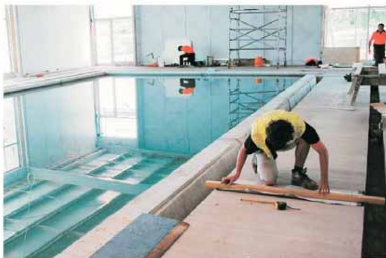
Complex plumbing, careful concrete work, and vapour proof barriers are some of the specifications C Lund & Son builders had to meet when building the new pool at Pioneer Stadium.

Lunds builders installing roof trusses and purlins in the new City Mission complex.