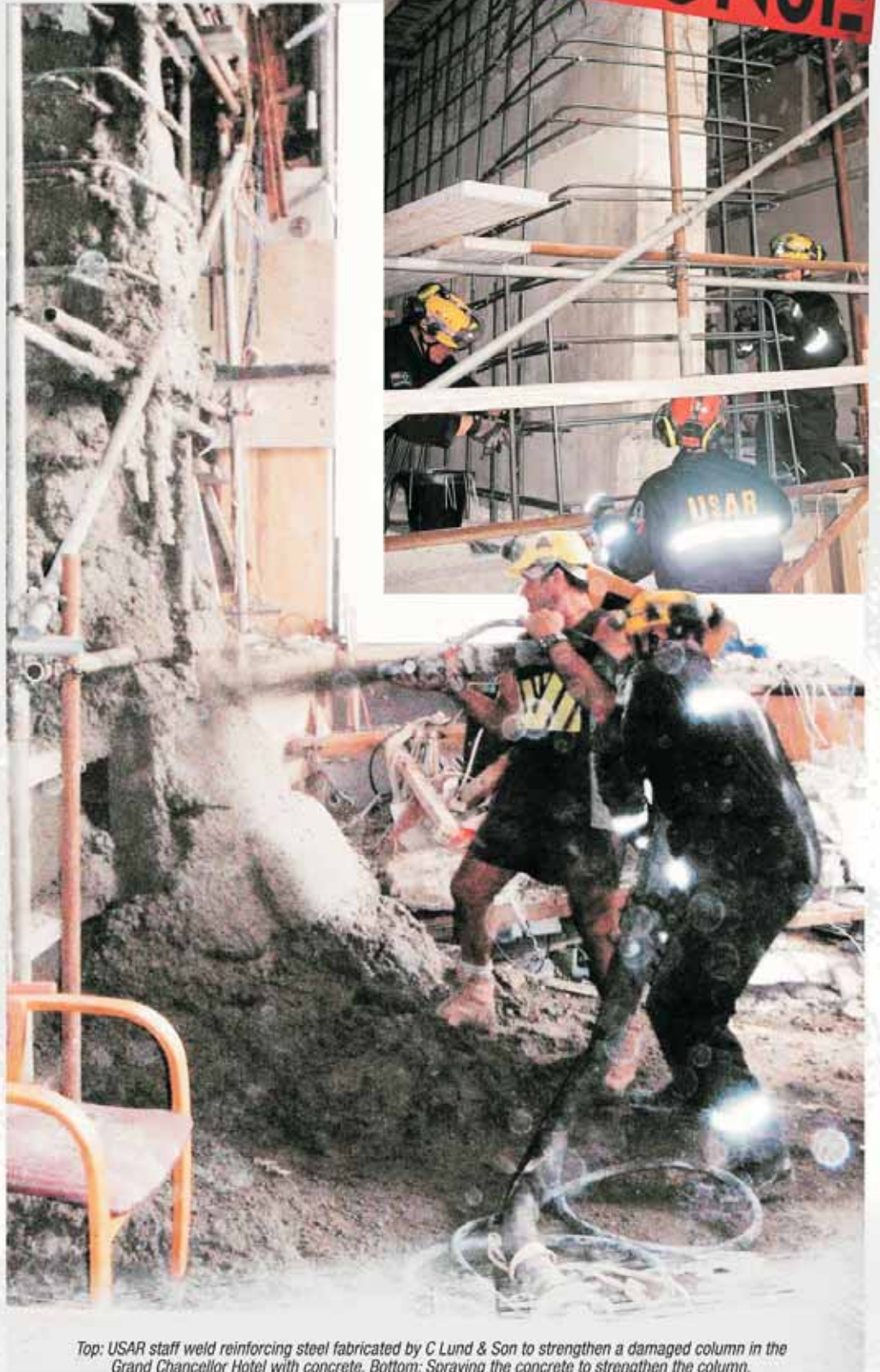
Top: USAR staff weld reinforcing steel fabricated by C Lund & Son to strengthen a damaged column in the Grand Chancellor Hotel with concrete. Bottom: Spraying the concrete to strengthen the column.