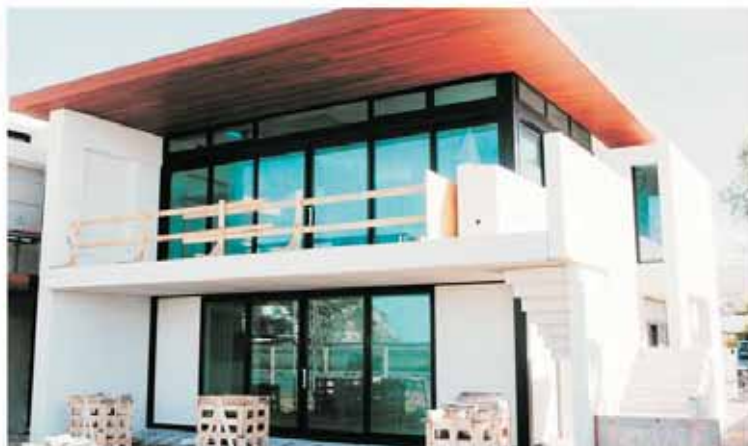
Lunds' precast operation provided the panels for this private residence on The Esplanade in Sumner.

While the earthquakes disrupted some of its work, C Lund & Son's precast division had a steady year supplying panels, beams and culverts for in-house jobs and other contractors.