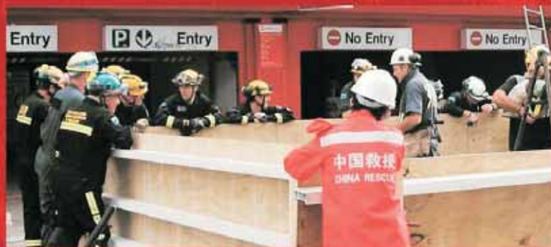
Lunds employees brief USAR staff on how to set up the form work and pour concrete to prop up the damaged column in the foyer of the Grand Chancellor.

Others are involved in constructing new buildings or doing major retrofits that will bring older buildings up to 67 percent or higher of current building codes.