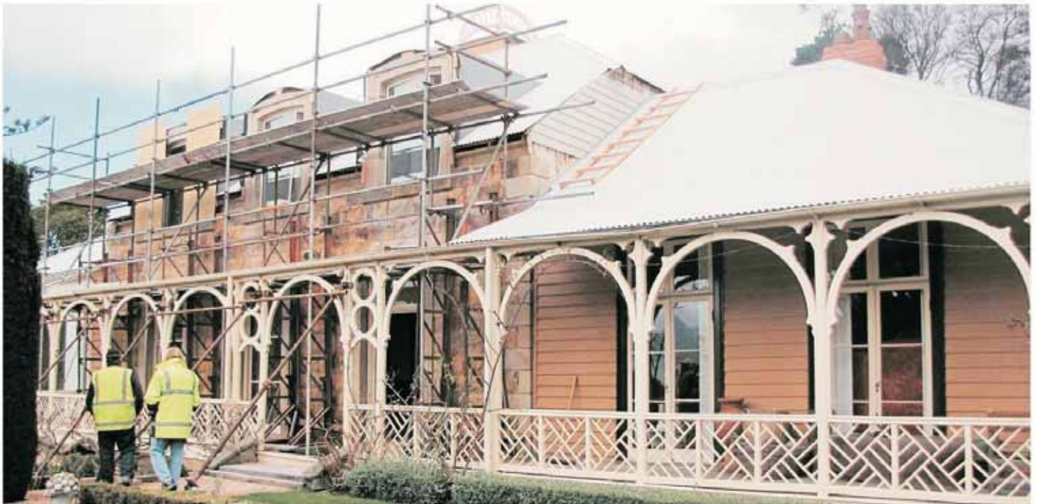
The finishing stages of the restoration and strengthening of Ohinetahi.